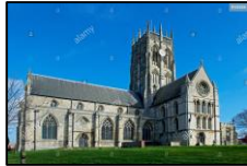
St Augustine's church

Our school community -the location of our school. The people who work in our school.