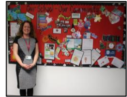
A picture of our school community

Children use Geographical enquiry to ask and respond to simple closed questions through teacher led enquiries, e.g. how many classrooms are there in our school? Which room is the biggest? Use first-hand observation skills to enhance their locational awareness and investigate their surroundings, e.g. of their journey to school, routes and places within school. Use information books, pictures, picture maps and globes as sources of information. Develop direction and location skills by following directions (up, down, left/right, forwards/backwards) Use a simple picture map to move around school and recognise that it is about a place. Draw around objects to make a plan. Find answers to simple questions about the past e.g. How has our school changed in recent years (new building) from sources of information? E.g. artefacts, photographs, observation and first-hand recount/interview.